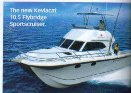
The new Kevlacad 10.5 Flybridge Sports cruiser.

Known for their seakeeping ability and soft, dry ride, Kevlacad hulls have been favoured among serious fishermen, commercial operators and rescue organisations alike. The new 10.5 Flybridge Sports cruiser retains the Kevlacad hull but has been designed with family boating in mind includ-